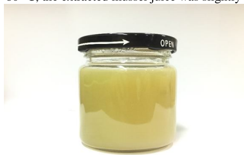
Figure 3. Asian Green Mussels extract 1:2 (w/v)

The Asian Green Mussel Sauce production by using extracted mussel juice extract at 1: 2 (w/v) by heated at 80° C, the extracted mussel juice was slightly turbid.