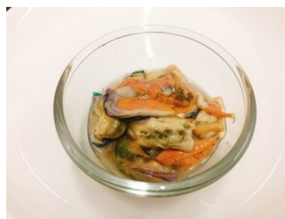
Figure 1. Typical characteristics of Asian Green Mussels.