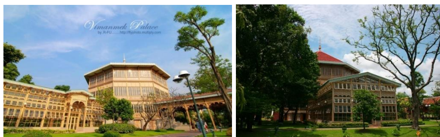
(1) Vimanmek Mansion1; (2) Vimanmek Mansion2

The beautiful perforated wood work at Vimanmek Mansion is not only a valuable architectural piece, but also reflects the fusion of culture, traditions, livelihood, and the beliefs of Thai people and Western people in a harmonized way, worthy of preservation. For this reason, the researcher emphasizes the perforated wood work in the Ginger Bread House style at Vimanmek Mansion, which is worthy of preservation and conservation to be passed along to the new generations. The author foresees the importance of Gingerbread wooden stencils in Vimanmek Mansion which should be maintained and preserved for the next generations. The author has studied style patterns and the production of Gingerbread wooden stencils in Vimanmek