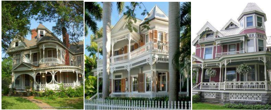
(1) The Ginger Bread Style House1; (2) The Ginger Bread Style House2; (3) The Ginger Bread Style House3

Although the Ginger Bread House style derives from the West, it does suit Thailand's weather since the carved wood serve as ventilation. It also suits the Thai aesthetic, with many houses often adapting the carving pattern to incorporate Thai traditional patterns, which add to the original beauty. Vimanmek Mansion is also built according to the Victorian style, influenced by the European style, but adapted to suit the Thai aesthetic seamlessly. The throne is shaped like an "L" and is 60 meters in length and 20 meters in height. The building has 3 floors, except for the royal residence, which has an octagonal shape and has 4 floors. The first floor comprises of brick work and cement. The other floors are built using golden teak wood painted with a cream color, with a red roof in an adapted Thai style. The building also has patterns on the windows and perforated ventilation air ways in the Ginger Bread House style. (Tanakom Bunkij,2006,P.34)