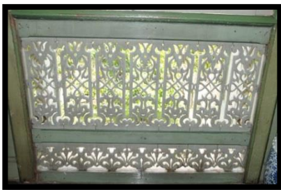
Figure 10 Photograph sample 5