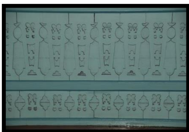
Figure 11 Photograph sample 6