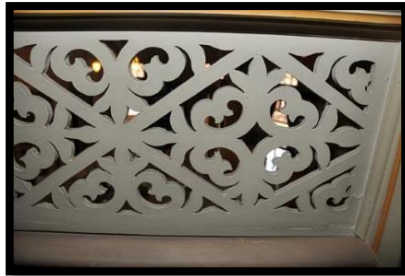
Figure 9 Photograph sample 4