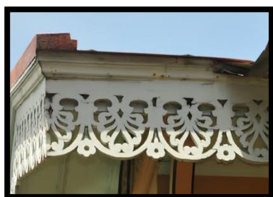
Figure 12 Photograph sample 7