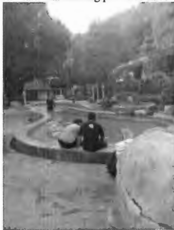
Fig. 1 Raksawarin Hot Spring, Ranong Province Source: Pornnapat Berndt, November 16, 2017

According from Vision and Mission of Ranong province to be a hub of transport goods between countries Andaman coast countries and preservation of city of Health Tourism and be livable environment [5] and there various tourist attraction therefore it can said that Ranong province have enough potential to be health tourism destination for tourist.