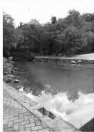
Fig. 2 Porn Rang Hot Spring, Ranong Province

Therefore, researcher then would like to study on elderly tourist requirement on accommodation and facilities which the expected when they traveling purpose to enhance standard of accommodation to satisfy elderly tourist group. in order to draw this potential group to come to visit Ranong Province which will generate income to local communities.