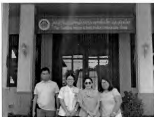
Fig. 4 Thai Traditional Medicine and Herbal product and demonstration Centre

International Institute for Trade and Development stated that “elderly market (60 Year old up) is another market that tends to increase in the future due to medicals and public health development which reduces death rate. These elderly tourists spend their living life after retirement for recreation and traveling. They have more time and budget readiness, marketing for elderly therefore is the new marketing channels as it is a potential target group. Even Though Thailand has Beautiful tourist attraction, however, if considerate in hospitality management for elderly tourist it found that still lack for this group” [8].