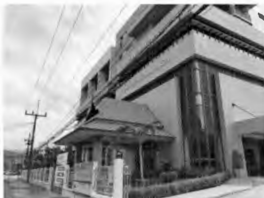
Fig. 3: Ranong Hospital Source: Pornnapa Berndt, November 16, 2017

of hospital for people health “Ranong Hospital” and “Thai Traditional Medicine and Herbal product and demonstration Centre” for preserve and rehabilitate people health. Therefore, it could say that Ranong province could be one of the elderly tourist destination.