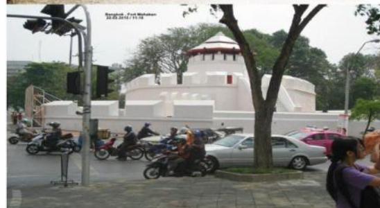
Fig.4:Mahakarn Fort in the past.