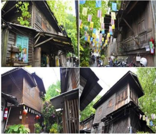
Fig.6: Households originally located in the Mahakan Fort community