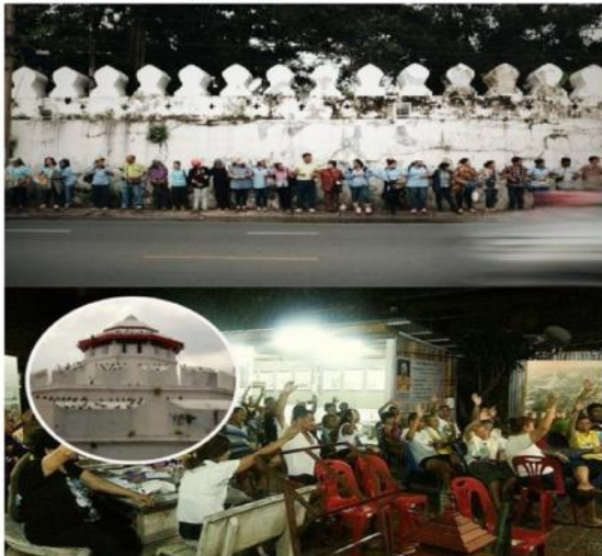
Fig.7: Members of the Pom Mahakan community and their supporters lock arms together in a symbolic show of opposition to eviction by the city.

Living museum. A living museum, also known as a living history museum, is a type of museum which recreates historical settings to simulate past time periods, providing visitors with an experiential interpretation of history. It is a type of museum that recreates to the fullest extent