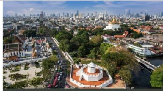
Fig.3:Mahakarn Forts and community are located at the center of the important historical place including with the national culture.

The plot is dead space surrounded by a wall and the river, which does not make it a suitable or safe space for a park. There are two crucial groups that can change the situation now: the government's Rattanakosin preservation committee and the cabinet. The committee is actually overlooking Rattanakosin policy. They can reconsider the plan and propose a new scheme to the cabinet, who can then state a new royal decree to help save the Mahakan community. (ChatriPrakitnonthakan Associate Professor of Silpakorn University's Faculty of Architecture)