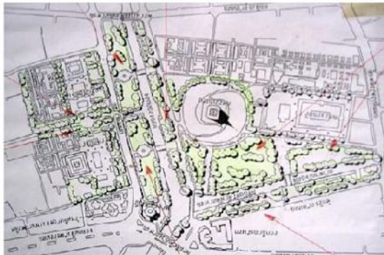
Fig1: The map show 14 forts location.