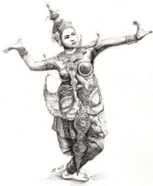
Figure 5 Ancient dancers