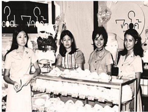
Figure 12 Wacoal lingerie shop in 1970.