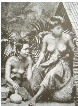
Figure3 Thai women with naked breasts