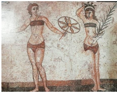
Figure 1 The picture of Minoan women.