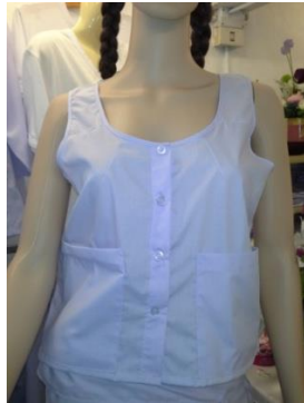
Figure10 Blouse with five seams.