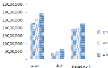
Picture 1. It horizontally shows the comparison of financial status.

As the picture 1, it shows that the financial status of Suan Sunandha Rajabhat University in 2014 and 2015 included an asset, a debt and a retained profit that increased from 2013.