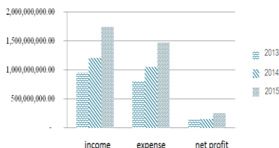
Picture 4. It shows the comparison of income and expense.

As the picture 4, it shows that the budget of 2013, 2014 and 2015 could earn higher than the expense that increasingly made the net profit every year.