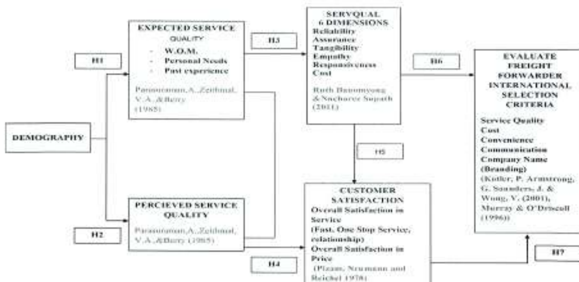
Figure 1: Conceptual Framework

Hypotheses are based on the theories discussion in related on this research articles.