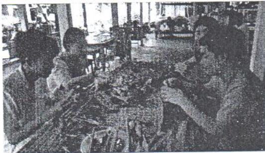
Fig.2. Tourist Activity at Homestay