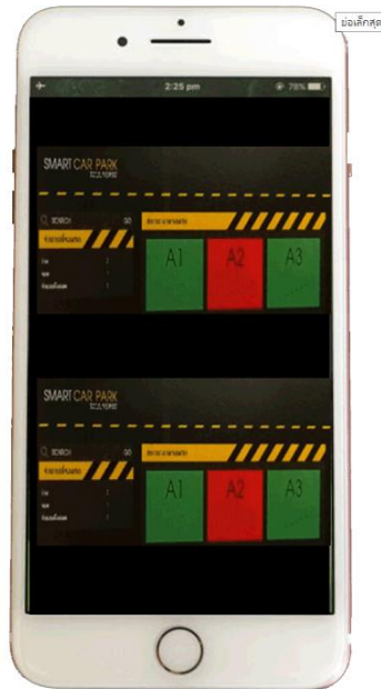
Fig. 3 Mobile application to retrieve car park information via IOT

This research developed a system based on IOT concept and technology for car park management. It retrieves parking information from ultrasonic sensors installed at the ceiling of each parking lot and provides online transaction for drivers and management. Drivers can search and track an available parking lot through smart phone application or web browser on smart phone. It saves driver's time to find a vacant parking lot, vehicle energy and reduces wear rate of vehicle. For car park management, it can manipulate parking lots very efficiently though web server and mobile application. This system can summarize pivotal reports in multi dimensions such as idle time, waiting time, and reservation. From Fig.3 shows the green boxes as vacant parking lots for first floor and second floor. The red boxes indicate that they are unavailable due to taken by some drivers or reserved by authorities. This information is provided through Internet of Things concept, as long as users and management are able to access to the internet, wherever what location on earth, they can send and receive data to this system 24/7.