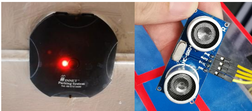
Fig.1 Ultrasonic sensor with box and unbox hardware

Ultrasonic sensors (also known as transceivers when they both send and receive, but more generally called transducers) work on a principle similar to radar or sonar which evaluate attributes of a target by interpreting the echoes from radio or sound waves respectively. Ultrasonic sensors generate high frequency sound waves and evaluate the echo which is received back by the sensor. Sensors calculate the time interval between sending the signal and receiving the echo to determine the distance to an object. This technology can be used for measuring wind speed and direction (anemometer), tank or channel level, and speed through air or water. For measuring speed or direction a device uses multiple detectors and calculates the speed from the relative distances to particulates in the air or water. To measure tank or channel level, the sensor measures the distance to the surface of the fluid. Further applications include: humidifiers, sonar, medical ultrasonography, burglar alarms and non-destructive testing. Systems typically use a transducer which generates sound waves in the ultrasonic range, above 18,000 hertz, by turning electrical energy into sound, then upon receiving the echo turn the sound waves into electrical energy which can be measured and displayed. The technology is limited by the shapes of surfaces and the density or consistency of the material. Foam, in particular, can distort surface level readings