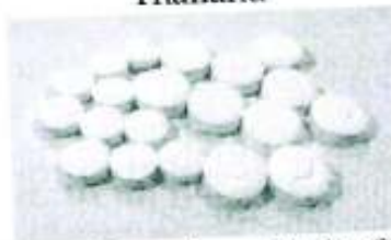
Fig.7 Polypharmacies With Steroid from Drugstores in the Samphanthawong District, Bangkok, Thailand