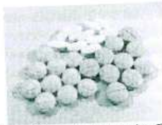
Fig.6 Polypharmacies With Steroid from Drugstores in the Pomprapsattruphai District, Bangkok, Thailand