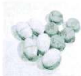
Figure 1: PolypharmaciesWith Steroid From Drugstores in the WangthonglangDistrict, Bangkok, Thailand

The samples of polypharmacy with steroid dispensed was asking for prescribed were photo and labeled as individual data (Figure 1-7).