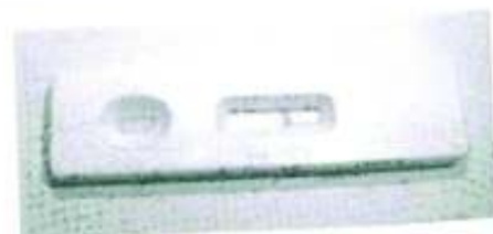
Figure 10B: Positive Control