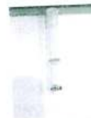
Figure 9: Test tube

Each 1/2 tablets from polypharmacy were gridded and filled until met the blue line of the test tube. Reagent was dropped into tube with sample contained until met the red line of the test tube. The suspending were mixed at list 3 minutes by vortex mixer homogeneously and standing for precipitated. The supernatant was dropped (4 drops) into the test well of Immunochrographic test kit (DMSc Steroid Test Kit, Thailand) and read the result rapidly and not longer than 10 minutes. The positive result was presented as one band at "C" region and negative result was presented as two bands at "T" and "C" region. Prednisolone and dexamethasone were used as positive control (Figure 10).