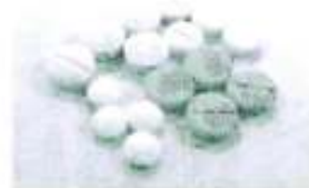
Figure 3: PolypharmaciesWith Steroid from Drugstores in the HuaikhwangDistrict, Bangkok, Thailand