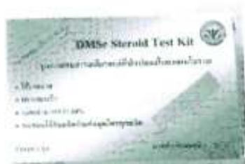
Figure 8: Test kit

This research was qualitative determined dexamethasone and prednisolone by immunochromatographic test kit from Bureau of Drug and Narcotic, Department of Medical Science, Ministry of Public Health, Thailand (Figure 8). Each tablets of drug set were gridded and filled until met the blue line of the test tube. Reagent was dropped into tube with sample contained until met the red line of the test tube (Figure 9).