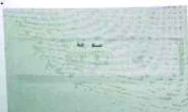
Figure 10A: Negative Control

Each 1/2 tablets from polypharmacy were gridded and filled until met the blue line of the test tube. Reagent was dropped into tube with sample contained until met the red line of the test tube. The suspending were mixed at list 3 minutes by vortex mixer homogeneously and standing for precipitated. The supernatant was dropped (4 drops) into the test well of Immunochrographic test kit (DMSc Steroid Test Kit, Thailand) and read the result rapidly and not longer than 10 minutes. The positive result was presented as one band at "C" region and negative result was presented as two bands at "T" and "C" region. Prednisolone and dexamethasone were used as positive control (Figure 10).