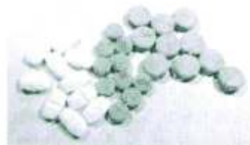
Figure 4: Polypharmacies With Steroid from Drugstores in the Pranakorn District, Bangkok, Thailand