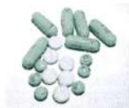
Figure 2: PolypharmaciesWith Steroid from Drugstores in the DindaengDistrict, Bangkok, Thailand